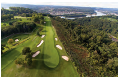
Longue Vue Club

Non-Profit Org. U.S. Postage PAID Pittsburgh, PA Permit #130