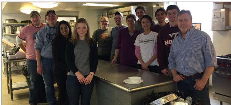
AAH volunteers helped prepare, serve, and clean-up a Valentine's brunch at Rainbow Kitchen.