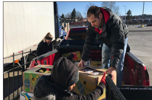
AAH volunteers loading up donations from Trader Joe's to take to Allies for Health+Wellbeing.

Join the Conversation facebook.com/alleghenycountybar @alleghenycobar www.acbf.org