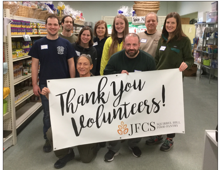
Attorneys Against Hunger volunteers receive gratitude for their efforts at the Squirrel Hill Food Pantry.

Attorneys Against Hunger campaign hosted 4 outreach events at area hunger service organizations. Volunteers helped stock pantry shelves, sort goods for pick-up, and prepare and serve meals to people in our community experiencing food insecurity.