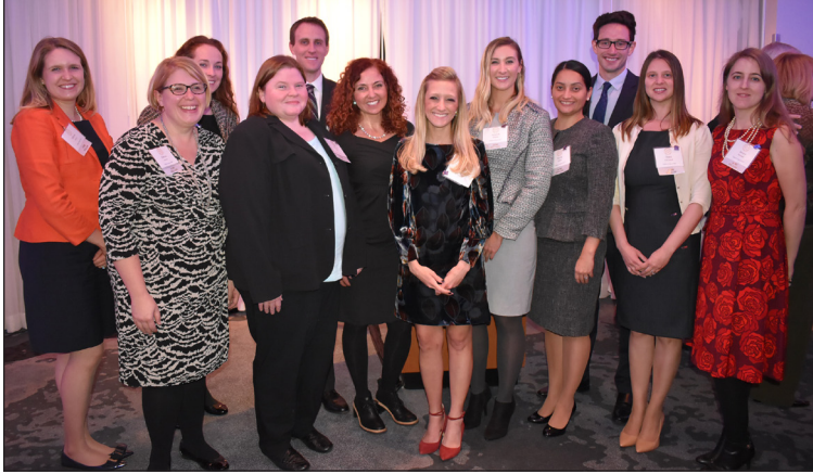
Members of the Fellows Class of 2017.

In November, ACBF hosted almost 200 award winners, new Fellows, and friends to celebrate a strong year of balancing justice, serving our community, and serving our profession.